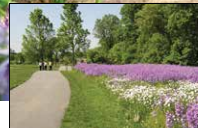
MONTGOMERY COUNTY, PENNSYLVANIA